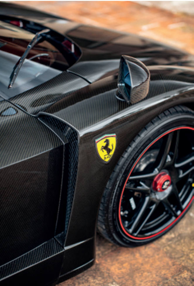
The visual feast continues in the passenger compartment and on the wheel rims, with many of the details highlighted in bright red.