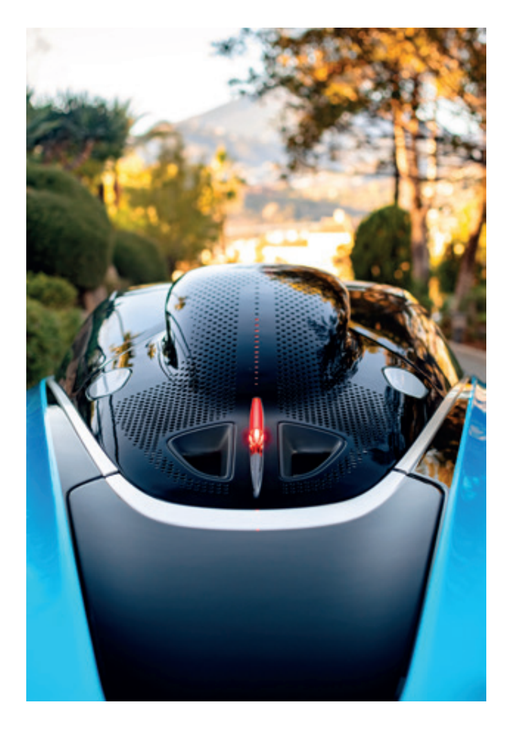
The engine's dual air intakes, separated by the third vertical brake light, are built into the roof so as not to disrupt the flow of air around the body.