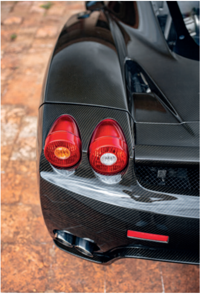
It's harder than it looks: bare and unpainted, carbon fibre doesn't tolerate any imperfections in its weave.