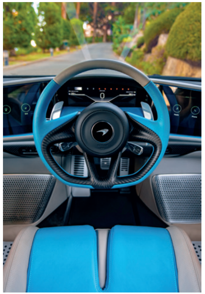
As on its glorious ancestor, the McLaren F1, the driving position is central, which also makes it possible to slim down the cockpit and reduce its frontal area.

flanked by two side passengers - a hallmark of its lineage. Echoes of the F1 resonate in subtle details, such as the shape of the small door windows. McLaren Automotive even limited production of the Speedtail to a mere 106 units - the same esteemed number as all F1 versions ever assembled. This deliberate choice not only underscores the exclusivity of the Speedtail but also honours the heritage and legacy established by its predecessor, further cementing McLaren's position as a pioneer in the realm of hypercar engineering.