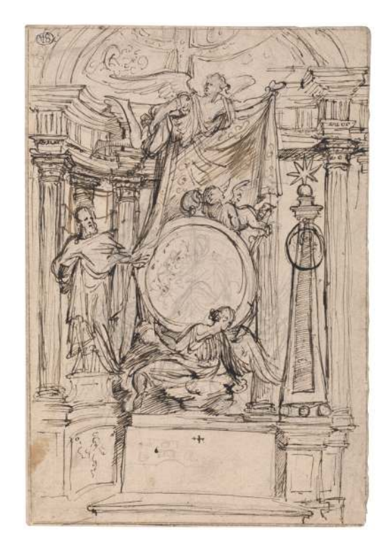
36. Hendrik Frans Verbrugghen, Design for an Altar, c. 1680–90

Wandelaar (no. 48) camouflaged his earlier ideas by means of pasted-on pieces of paper on which he drew an alternative solution. The Design for an Altar by Hendrik Frans Verbrugghen (no. 36) is a typical, early-stage architectural drawing that presents (to the patron?) a choice between different possible designs. That minor and even major adjustments were made until the final stage