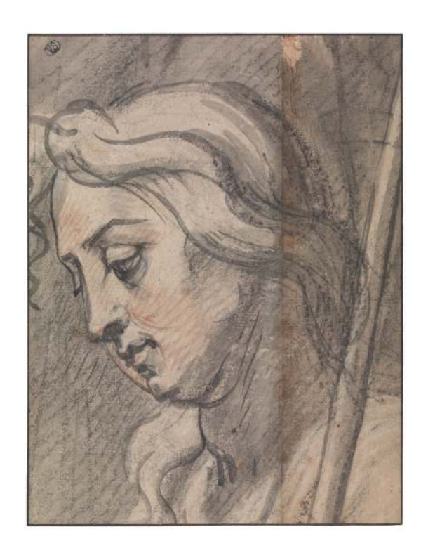
30. Theodoor van Thulden, Head of a Shepherd (?)

works were more likely to have come from the studio or circle of the artist to whom they had previously been attributed, whereas the sheet that was only tentatively attributed to Pierre Mignard in the past (no. 34) could now be assigned to him with confidence. Iconographic puzzles were resolved; the iconography of other subjects was fine-tuned or explored in more depth and,