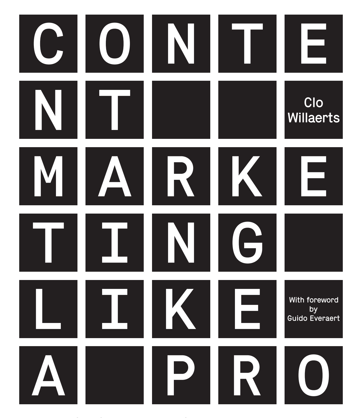
The All-In-One Guide to Digital Content Marketing: From Planning to Promoting