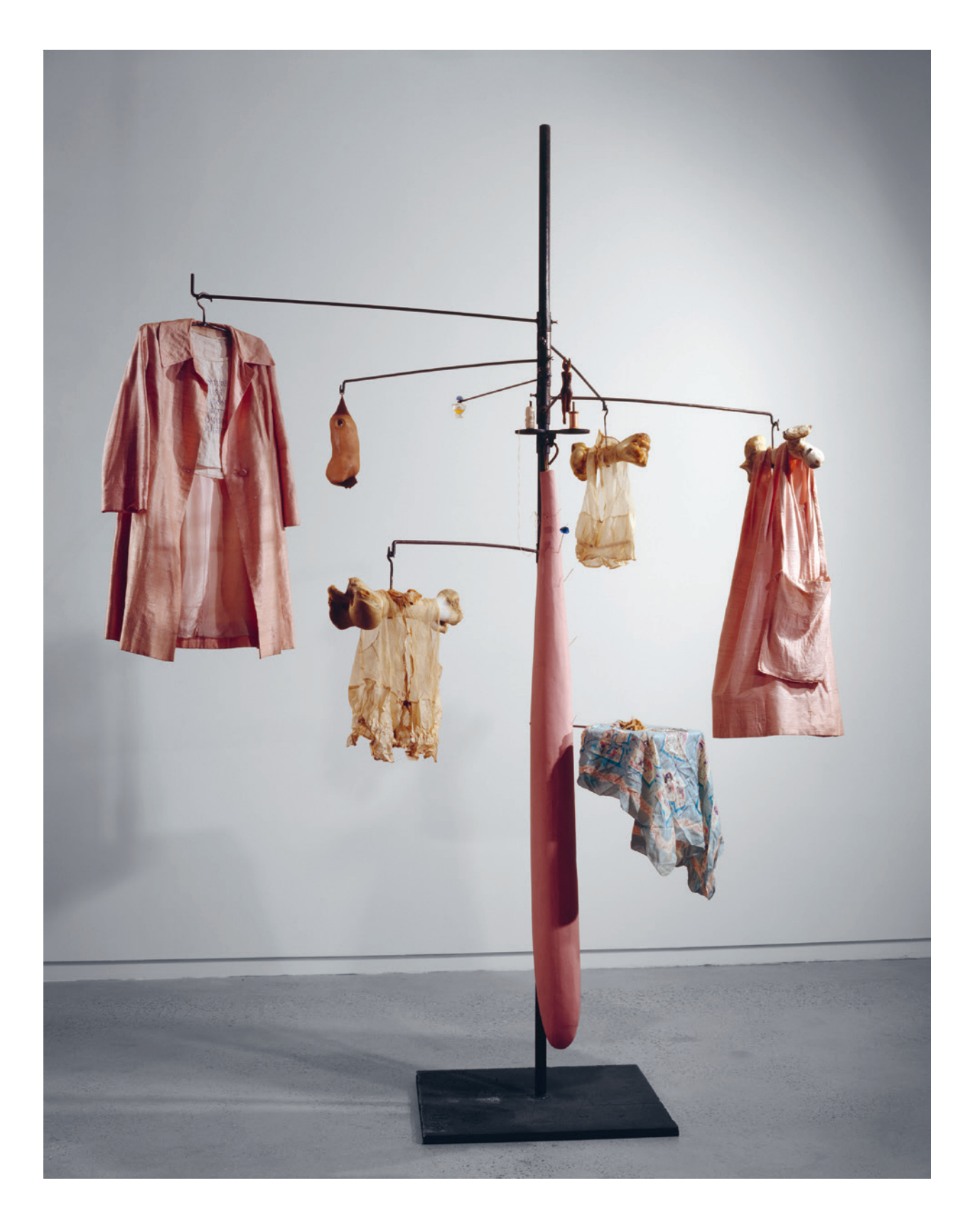
Louise Bourgeois Pink Days and Blue Days, 1997