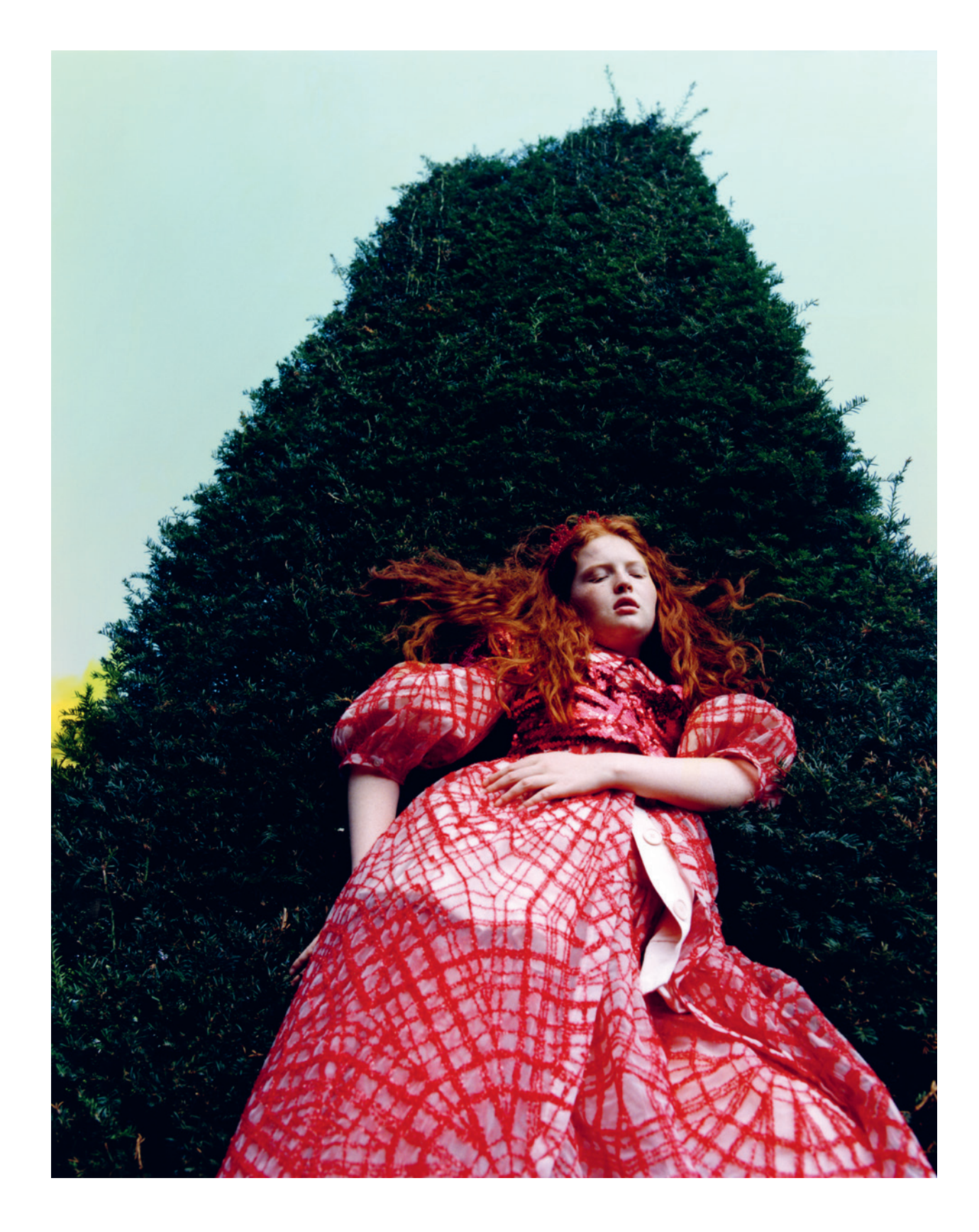
SIMONE ROCHA Autumn-Winter 2019-20