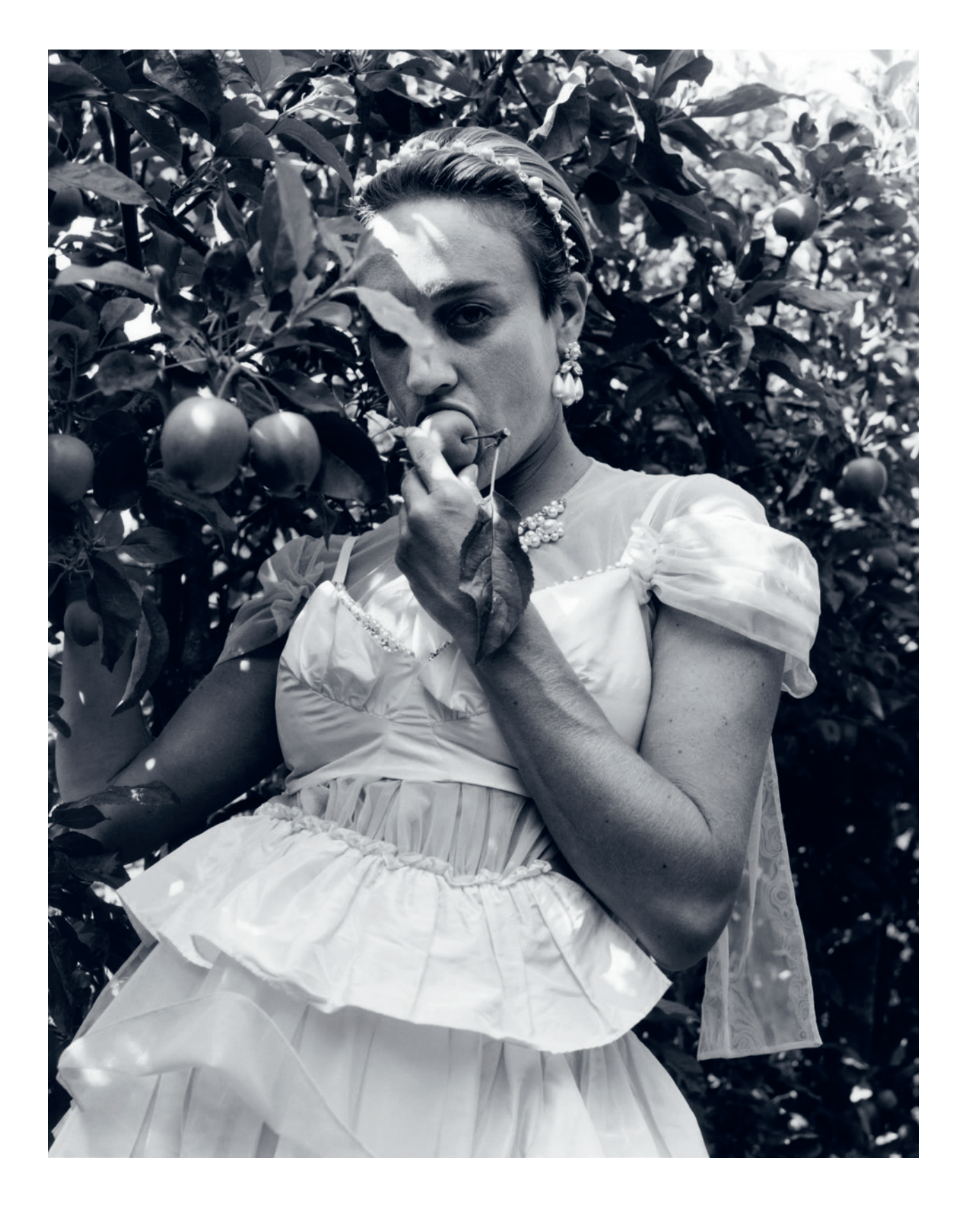
SIMONE ROCHA Autumn-Winter 2019-20