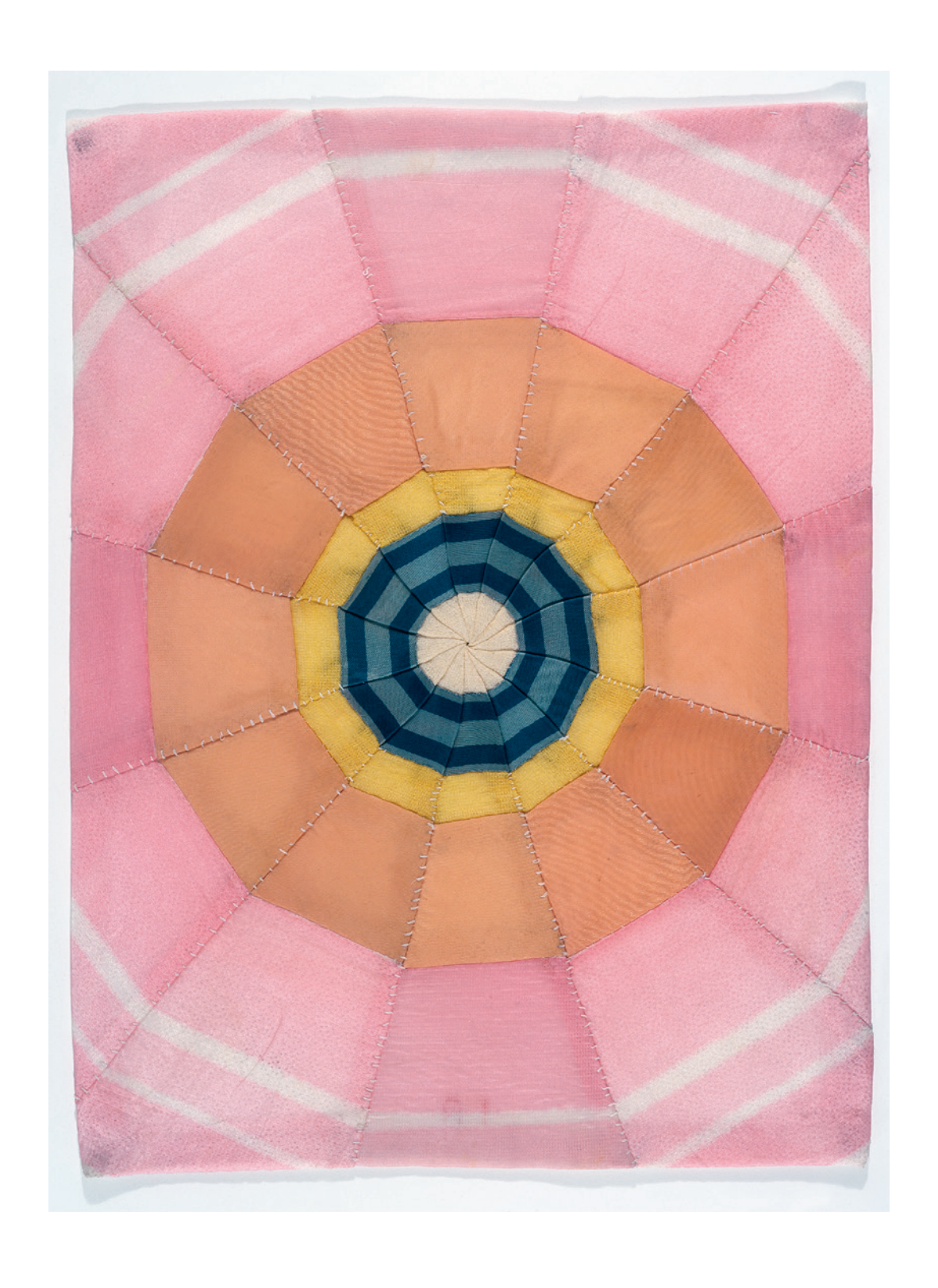
Louise Bourgeois Dawn (detail), 2006