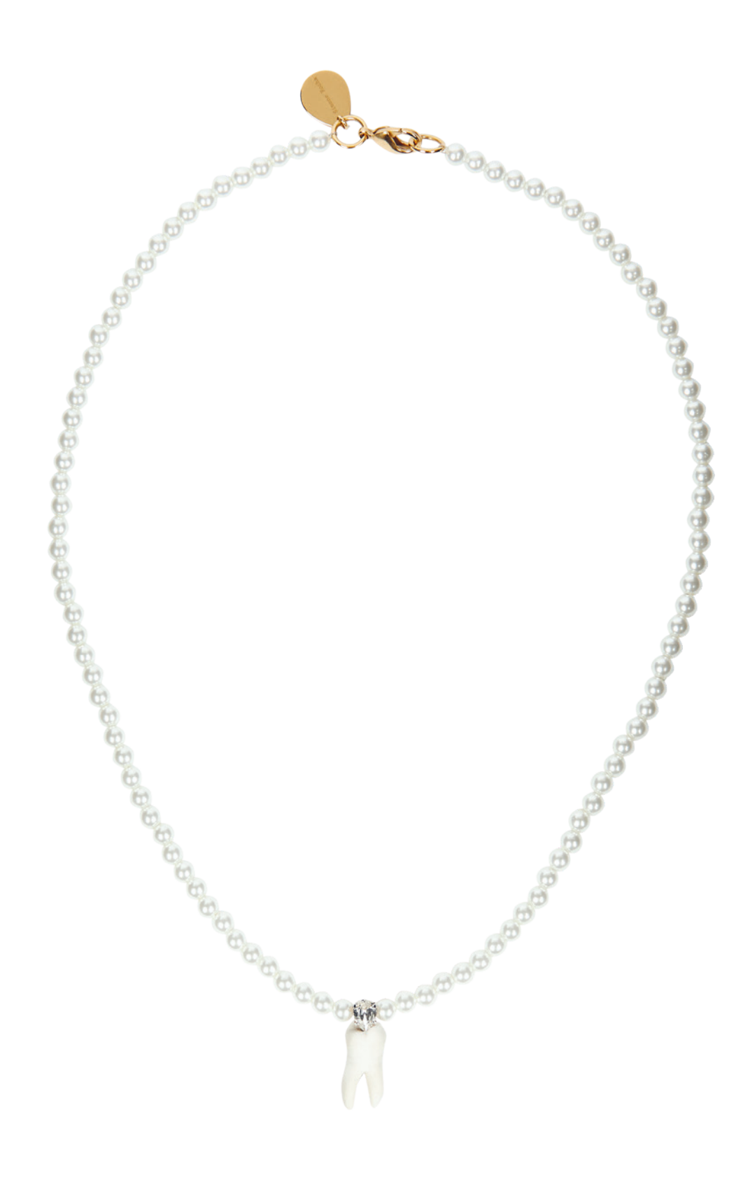
SIMONE ROCHA Spring-Summer 2022